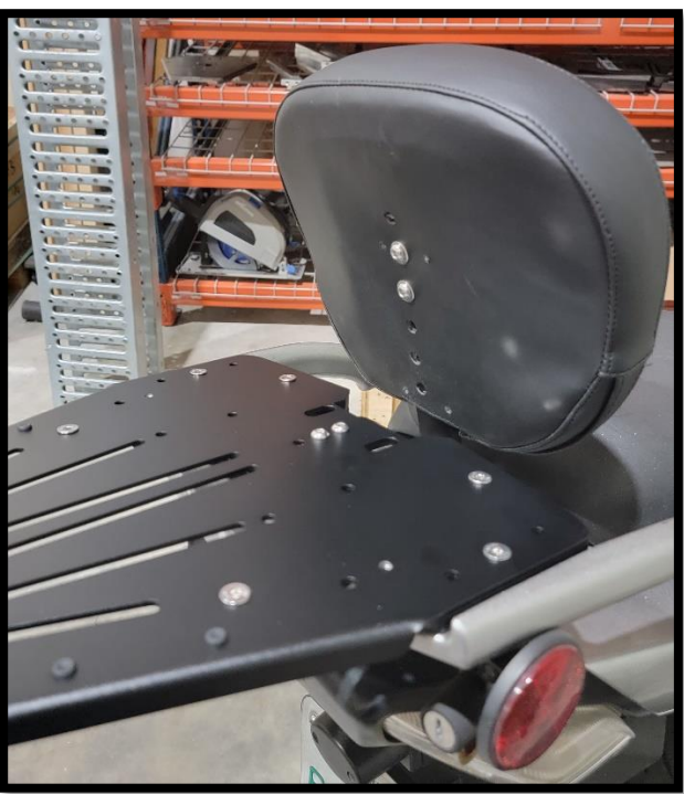
Externally Mounted Backrest Pad